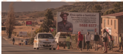
Mohale's Hoek Puma Filling Station, (6M X 3M)