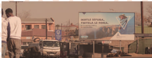
hlotse, (6M X 3M)