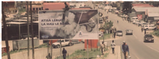
Gacha's Nek, taxi rank (12M X 3M)