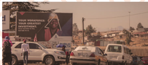
Botha Bothe Inner Town, (6m X 3m)