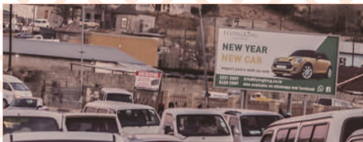
Thabong circle, from town (6M X 3M)