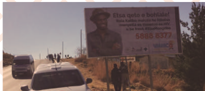
Qacha's Nek town, (6M X 3M)