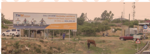
Maqalika, (12M X 3M)