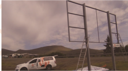
Thaba -Tseka, Town (6M X 3M)