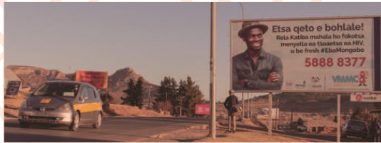
Mafeteng Thabaneng, (6M X 3M)