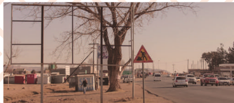
Maputsoe Hanyenye crossing , (6m X 3m)