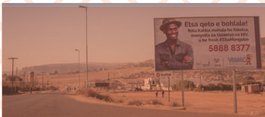
Hlotse Amerika, (6M X 3M)