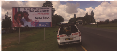
Maseru Ha Makhalanyane, (6M X 3M)