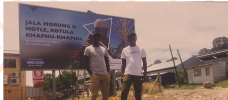
Mokhotlong makhakhe shopping complex, (6M X 3M)