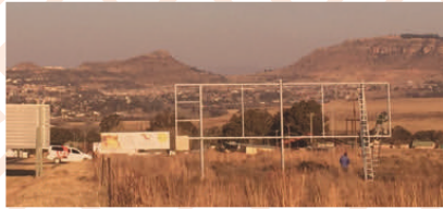
Maseru border, (12M X 3M)