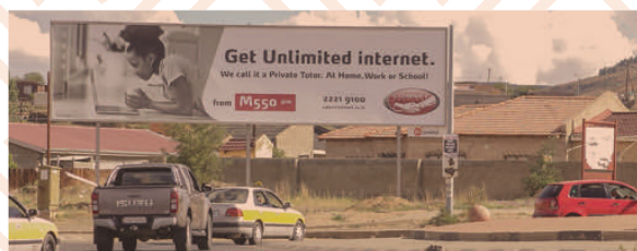
ha thetsane circle, near puma filling station (12M X 3M)