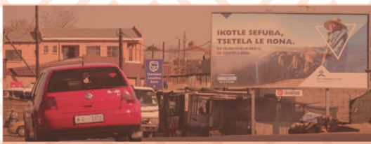
Hlotse near town park, (6M X 3M)