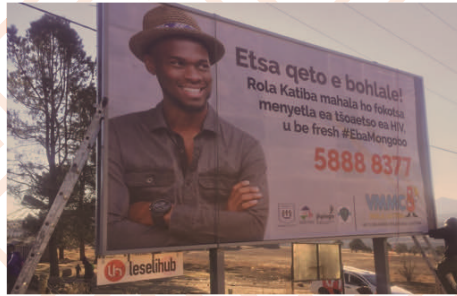
Mokhotlong From Town, ( 12M X 3M)