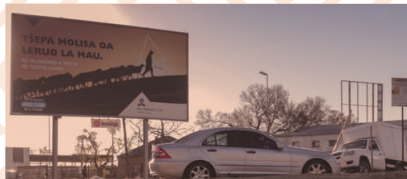
Mafeteng, main circle (12M X 3M)