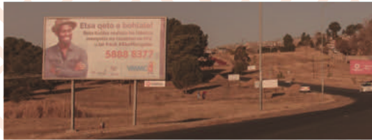
Teyateyaneng, (12M X 3M)