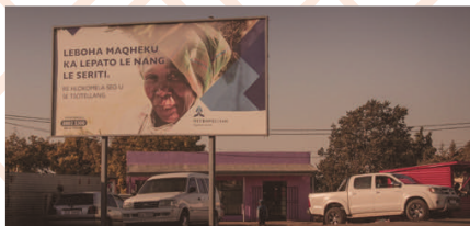
Teyateyaneng, near build it hardware (12M X 3M)