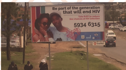
Maseru Machache, (5M X 3M)