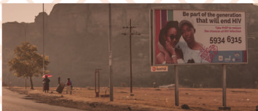
Teyateyaneng Next To Taxi Rank, (6M X 3M)