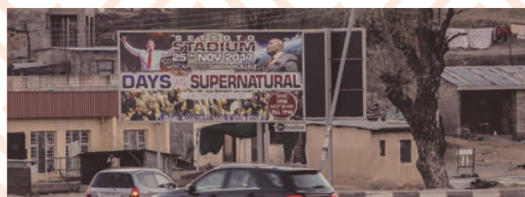
Thabong circle, (6M X 3M)