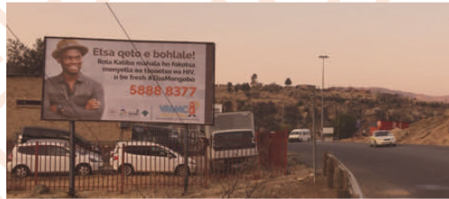
Quthing Taxi Rank, (6M X 3M)