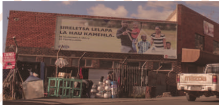
Quthing, inner town (6M X 3M)