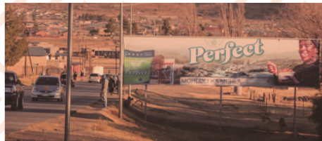
Mafeteng The Mill, (12M X 3M)