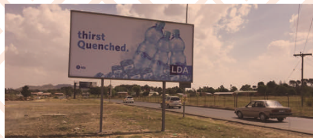
Maseru temong, ( 6M X 3M)